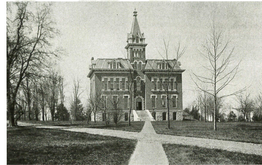
Vanderbilt's original 75-acre campus was largely treeless, so saplings were planted alongside new building construction, evident in this early photo of Benson Science Hall, erected in 1880. Many of the young trees were taken from the hills surrounding Hillsboro Pike.

In 1988, the Vanderbilt campus was granted official arboretum status by the American Association of Botanical Gardens and Arboreta. Vanderbilt's collection of trees focuses on native species maintained to look much as they would in nature, with a minimum of pruning or shearing. Many of them are identified with tags, thanks