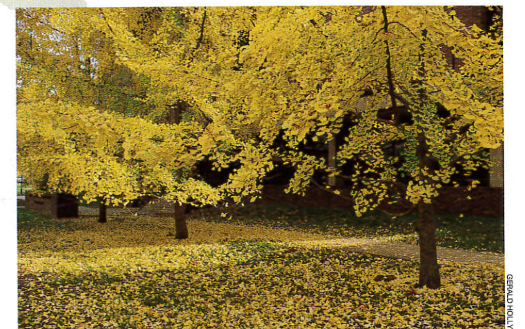
The fan-shaped leaves of the ginkgo tree have been found in fossils that date back 280 million years. Kernels of their plumlike fruits are considered a delicacy by the Chinese, but the fruit's outside flesh is famous for its obnoxious odor. Recent cloning technology has made it easier to obtain odor-free male ginkgos. The ginkgos pictured here grow outside the Hobbs Laboratory on the Peabody campus.